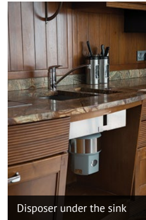
Disposer under the sink

The disposer is mounted under the sink drain and attached to the sink using the special locking mechanism. The disposer discharge is connected to the standard S-trap. No special tools or parts are needed. Status Disposer can replace any standard disposer. Any experienced handyman can easily complete the installation in about one hour. The disposer power cord is connected into a standard electrical outlet. The Sinktop air switch is connected to the disposer by means of a plastic air tube thus providing the user protection from electrical shock.